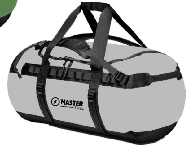
CUSTOM TOTE BAG