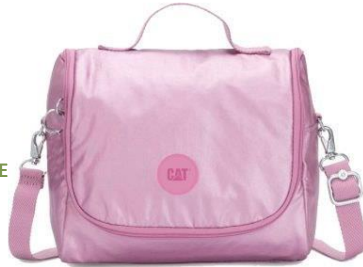
CUSTOM LADIES PINK PURSE

Production time: 4-6 weeks (depending on work load).