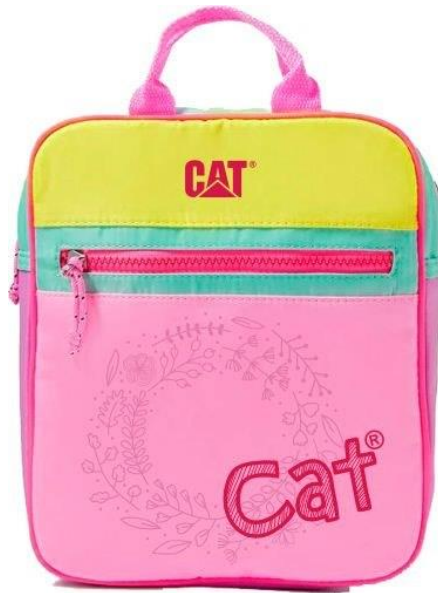
CUSTOM YELLOW/PINK LUNCHBOX

Production time: 4-6 weeks (depending on work load).