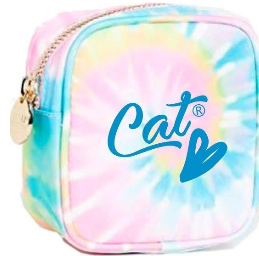
CUSTOM COLORED LUNCHBOX