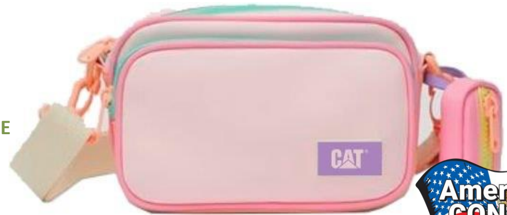
CUSTOM CROSSBODY PINK PURSE

Production time: 4-6 weeks (depending on work load).